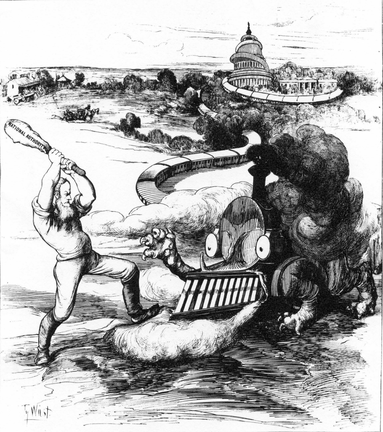
THE FARMER AND THE RAILROAD MONSTER WHICH WILL WIN